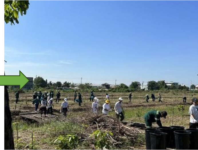
The result is lush greenery and natural ozone.